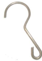
9561 – Spring hook s/st