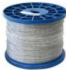
21799 – Wire braided 1.1 mm /5kg roll