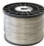
STABRA – Wire s/st braided / 800m