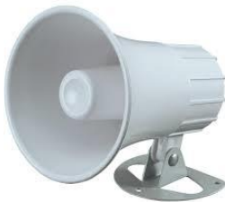
7295 – Siren 15W white