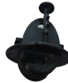
20544 – Bobbin clip on (y-std) black