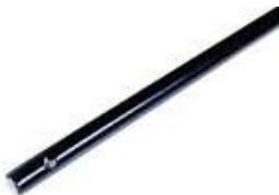
5356 - Stay 600mm black 9203 - Stay 600mm white EFS800B - Stay 800mm black