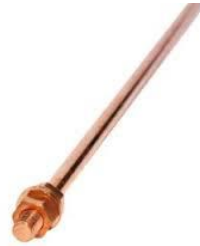
ES1.2M – Earth spike 10mm x 1.2m