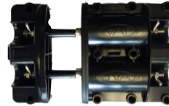
23230 – Gate contact inline 2 pin