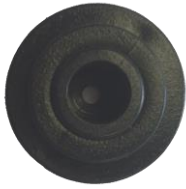
882 – Bobbin FB black