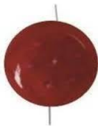
N704 – Fence light Stafix