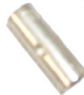
1501 – Ferrule 6mm/100