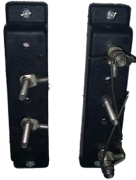
3883 – Gate contact series