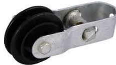
10351 – Tensioner combo (black bobbin)