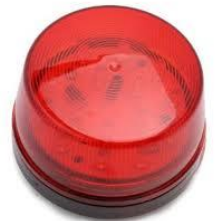
PA1500H – Strobe light 12V red small