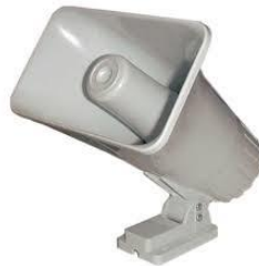
6905 – Siren 30W