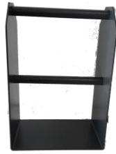
CABR22 – Braided cable reel – 15/22Kg