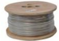
ALUMBRW –Wire braided aluminium 1.6mm / 1000m roll