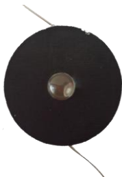
FENCELIGHT – Fence light -DTS