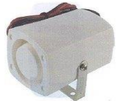
SBOMB – Sound bomb 12V mini