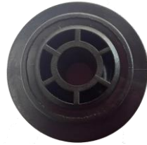
5161 – Bobbin RB black