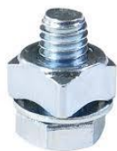
5361 – Line clamp 6mm