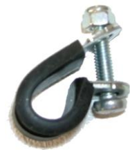
7678 - Stay rubber clamp