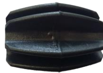
9725 – Strain jumbo black