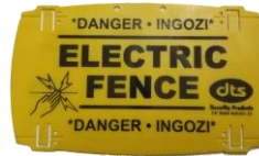
EFCLIP – Sign clip on - DTS