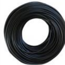
5157 – HT cable 50m