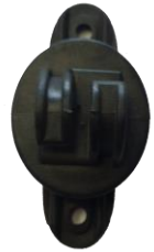
5159 – Bobbin nail on black h/duty