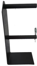
CABREE – Braided cable reel – 5kg