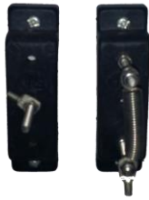
10569 – Gate contact s/pole