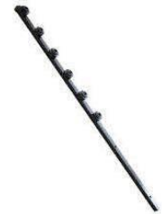
8870 - STS 6L black 12863 - STA 6L black 9456 - STA 6L black nt 9478 - STS 8L black EFPSTA8LB - STA 8L black EFPOLESTA8L - STA 8L black nt