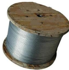
9073 – Wire braided 1.1 mm / 20kg roll