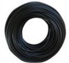
5156 – Ht cable 100m